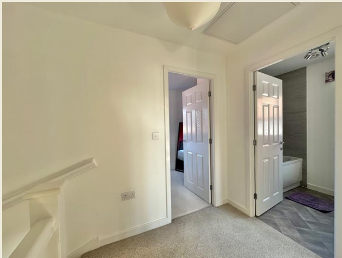
MASTER BEDROOM ONE