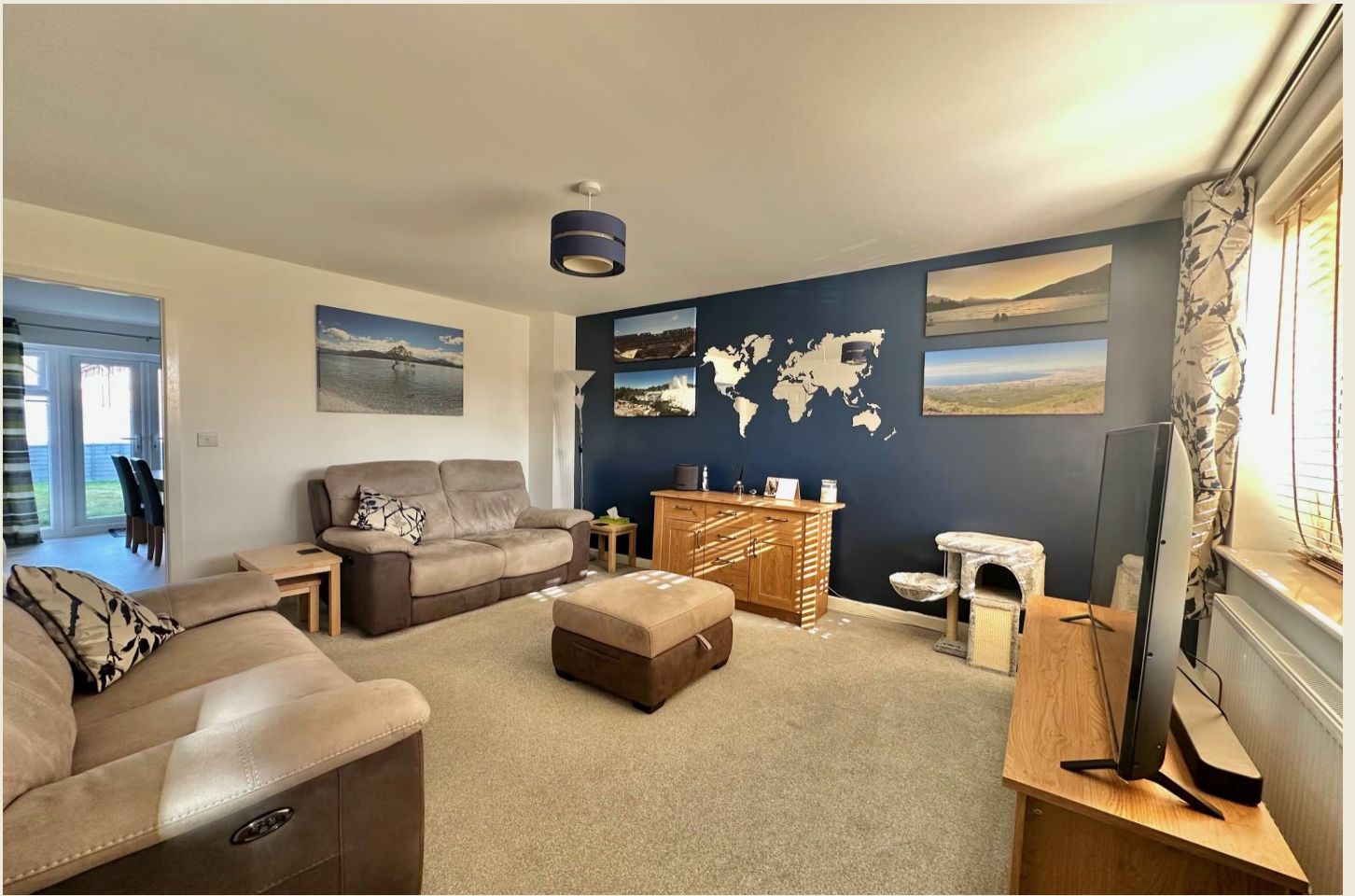
THE ACCOMMODATION:- With approximate dimensions, comprises;